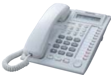
■ KX-T7730 LCD, Speakerphone Unit

* An optional card is required. Please contact your dealer or phone company to confirm if the Caller ID service is available in your area.