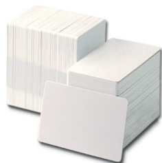
PLAIN CARDS RF or IC TYPE