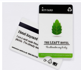
Printed Hotel Keycard back to back