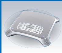
IP Conferencing Phone