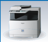
A4 Color Multifunction