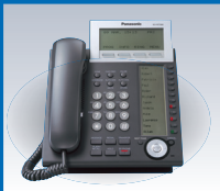
Business Telephone System