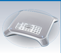
IP Conferencing Phone