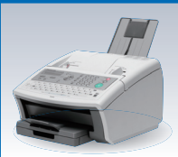
Plain Paper Laser Fax